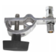
QUICK RELEASE HINGE MOUNTS