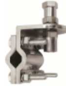
HEAVY-DUTY DOUBLE GROOVE MIRROR MOUNTS