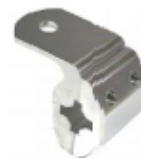
HEAVY DUTY 3-WAY MIRROR MOUNT