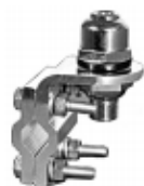
HEAVY-DUTY MIRROR MOUNTS WITH DOME STUD