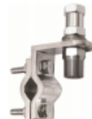
HEAVY-DUTY SLIM LINE MIRROR MOUNTS