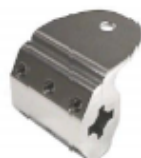
SUPER HEAVY DUTY 3-WAY MIRROR MOUNT