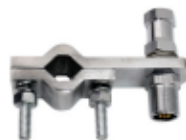
3" DOUBLE GROOVE HORIZONTAL MIRROR MOUNTS