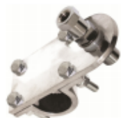
1-1/8" OMNI GRIP MIRROR MOUNTS - FREIGHTLINER