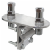
DELUXE TWO-SIDED MIRROR MOUNTS