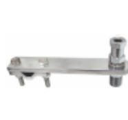
6" HORIZONTAL MIRROR MOUNTS