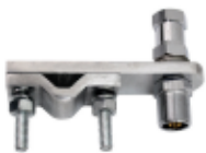
4" HORIZONTAL MIRROR MOUNTS