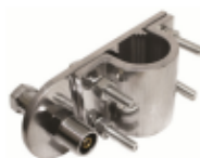
1-1/4" OMNI GRIP MIRROR MOUNTS - INTERNATIONAL