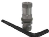
STAINLESS STEEL DOUBLE HEX SO239 STUD