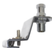
HEAVY-DUTY BUMPER MOUNTS